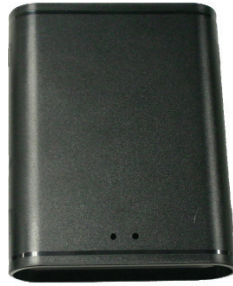
Charcoal Black (Code CB)