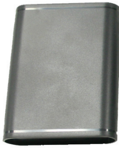
Dark Gray (Code DG)