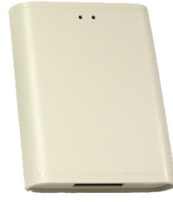
Beige (No Color Code)